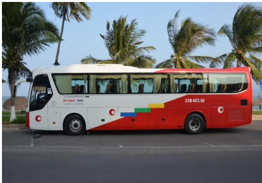
# Opera House Saigon